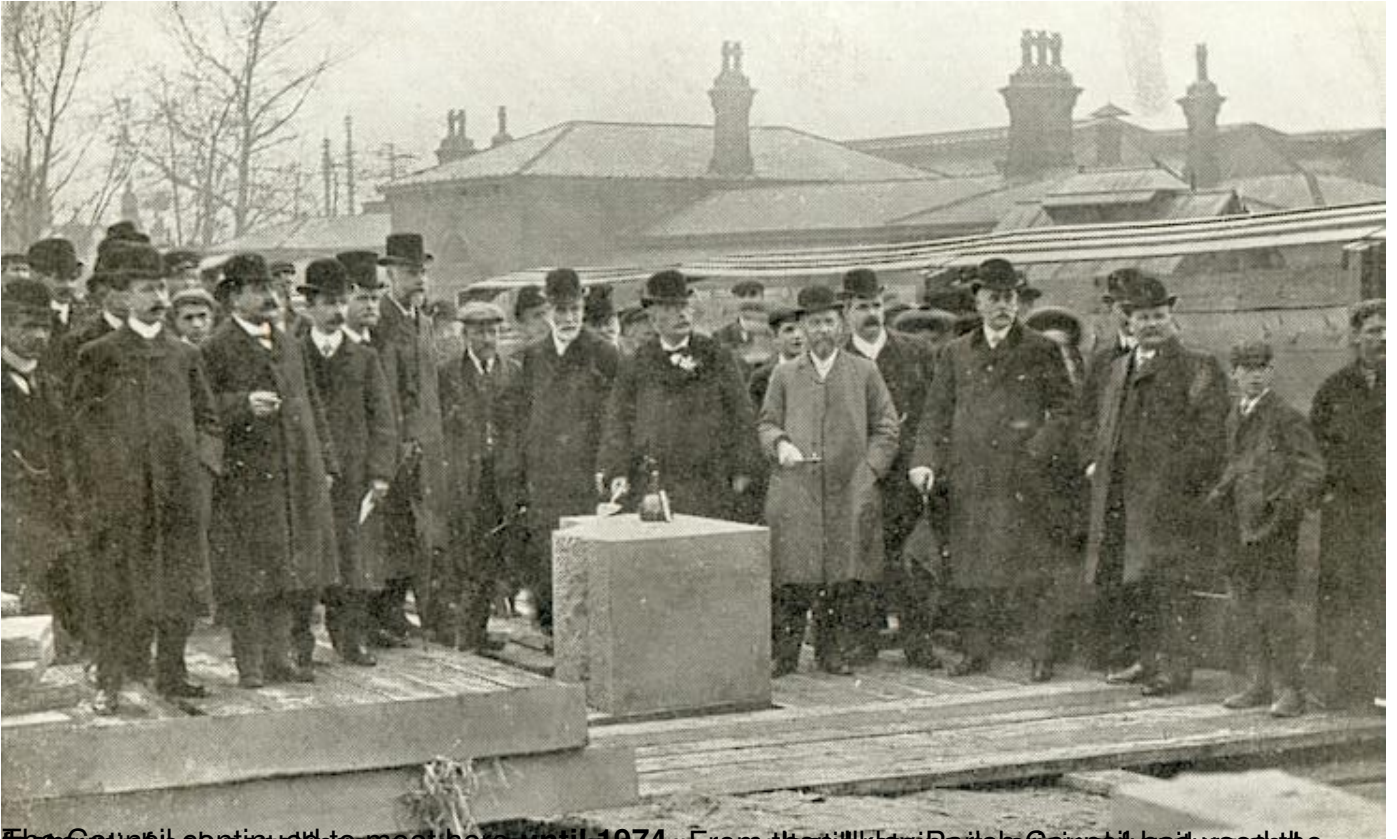
The Council starting with the meeting with in 1874. From the left to right: Council members and the

With a number of tasks, the King's Hall was built in 1874. The Council members and the